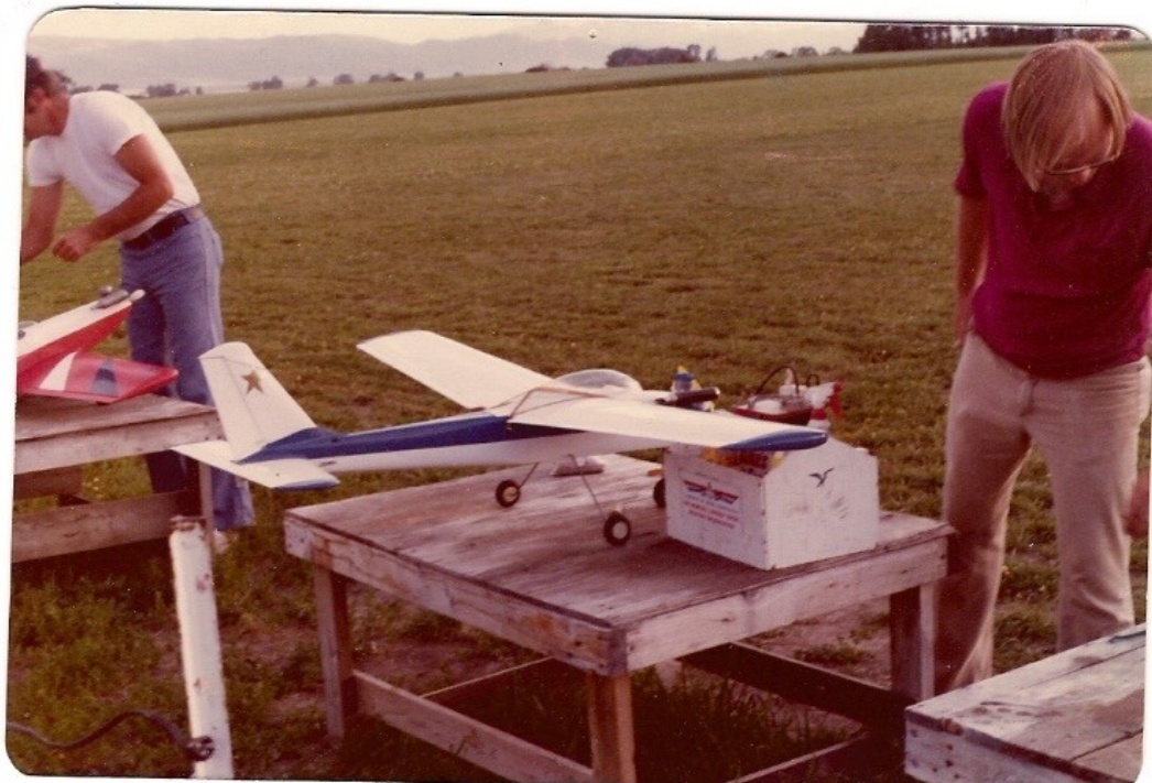
Top - Various locations.