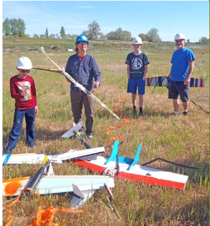
Picking up debris after a round with heavy losses.