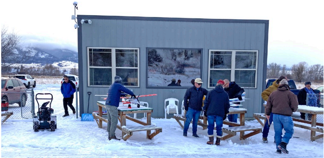
Above: Club members readying their airplanes for flight.