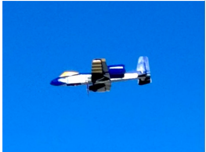
Above, our 'gang' at the December meeting. Above right, a foamy that looks like an A-10. Below, a couple more photos!