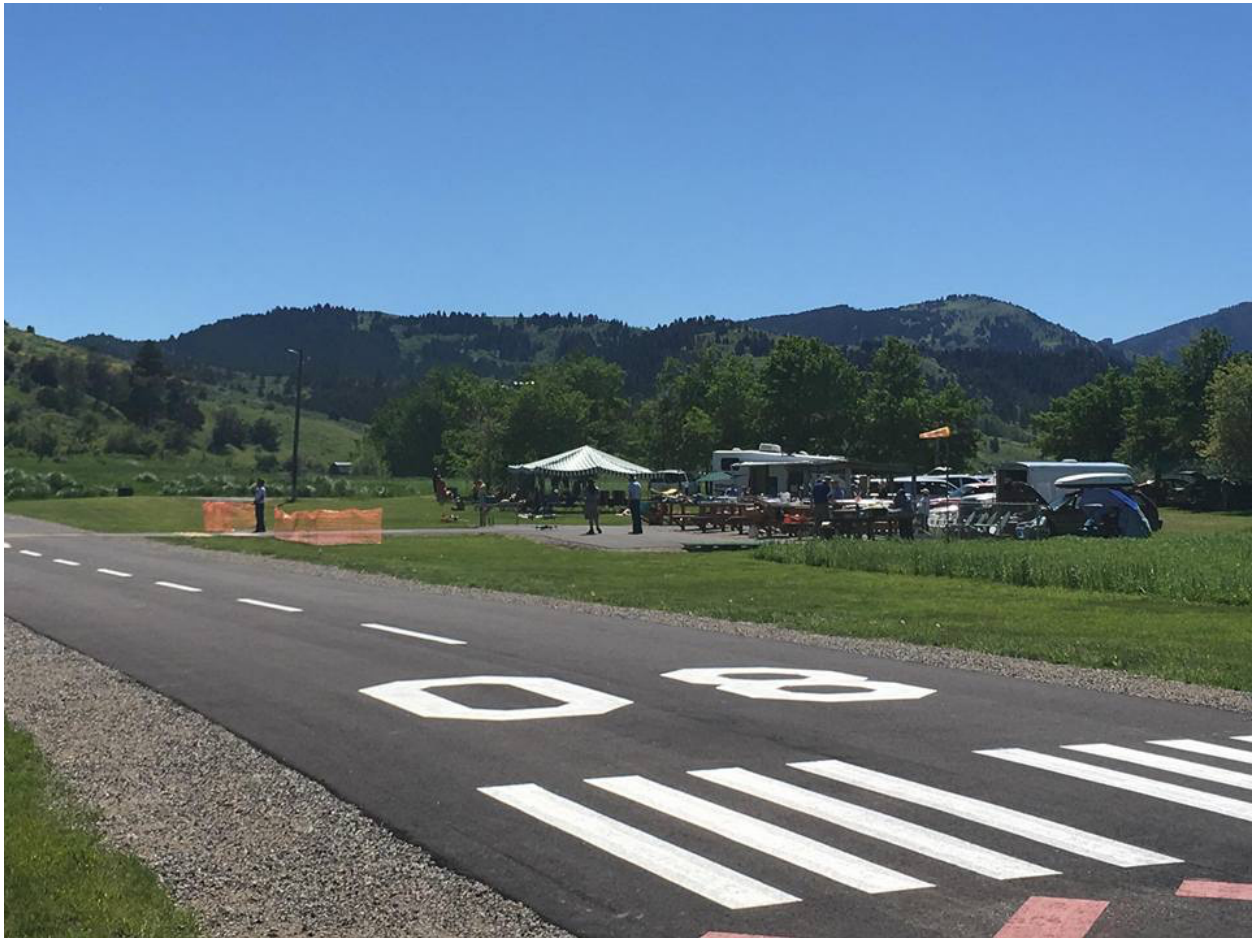
A couple photos from the June 4th Fun Fly. Above: What a great looking field!